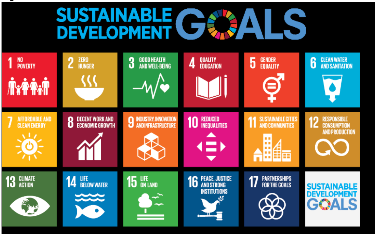
Fig 1 UN SDG's